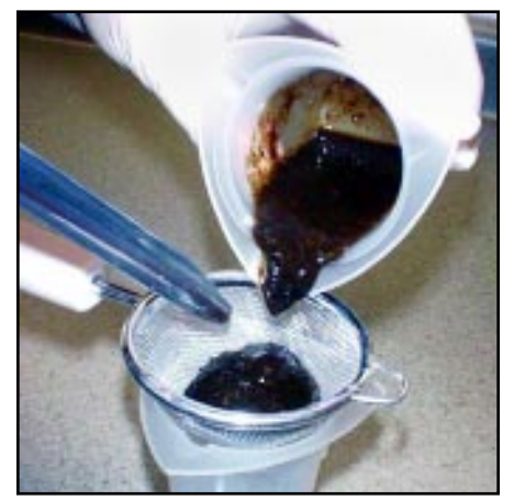
Pour the mixture through a tea strainer and into another 100 ml beaker.