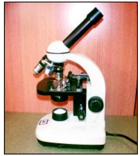
A good quality microscope is a very important tool for monitoring alpaca herd health. The microscope should have a metal frame, DIN optical glass lenses, mechanical stage, coarse and fine focus adjustment, metal gears, ball bearing moving parts, and magnification from 40 to 200 times.

ment. Liquid material should be clinging to the underside of the cover slip.