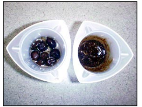
Place eight alpaca pellets and 20 cc of flotation solution in a 100 ml beaker. Thoroughly break up the pellets and form a well mixed solution.