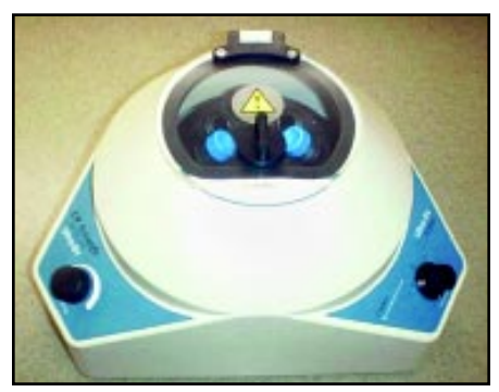
The centrifuge should be capable of spinning at 1,500 rpm and accommodate several 15 cc test tubes. Balance the load by placing test tubes in opposite openings in the centrifuge.