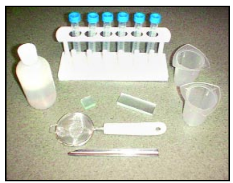
Equipment needed for parasite detection includes glass microscope slides, cover slips, tapered 15 cc test tubes, test tube tray, 100 ml plastic beakers, tea strainer, laboratory spoon, and flotation solution.