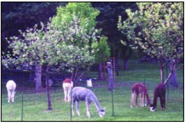
Above and left, animals at Alpaca Country Paddocks enjoy lush pastures under flowering trees.

our clothing, and tickle our cheeks with their soft noses. We are positive that we found the right business to be in as we are greeted at our backdoor every morning by our alpacas awaiting their morning feed.