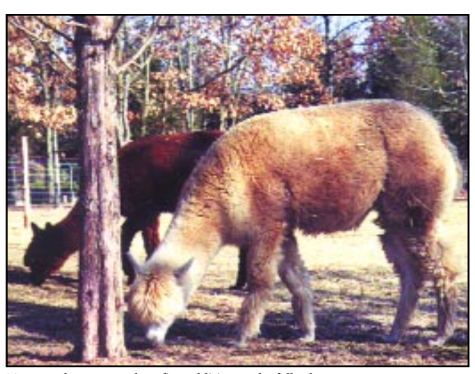
Topaz and Rosette make a fine addition to the fall colors.