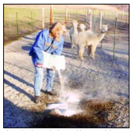
Clean the dung pile thoroughly. Spread the barn lime over the area and wet down with water. Stir up and shape into a domed mound.

On a small alpaca ranch, the daily manure handling routine will include grabbing a "bean scoop," rake, and five gallon buckets or a wheel barrow and heading to the dung pile in each pen. The alpaca droppings (or beans) are raked into the scoop and then scoopfuls are emptied into the bucket or wheel barrow. When the buckets or