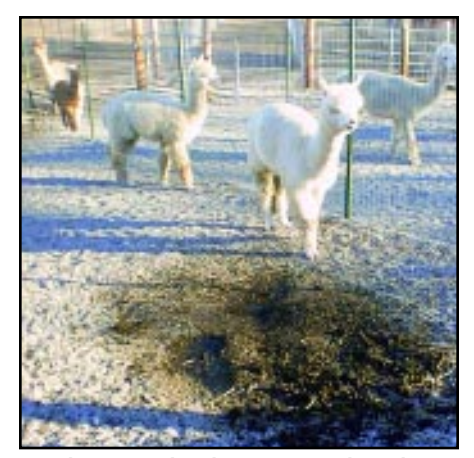
Barn lime is used to dose manure piles in barns or alpaca pens. It is very good to use on dung piles that have sunken in and are collecting urine or rainwater and are staying wet.