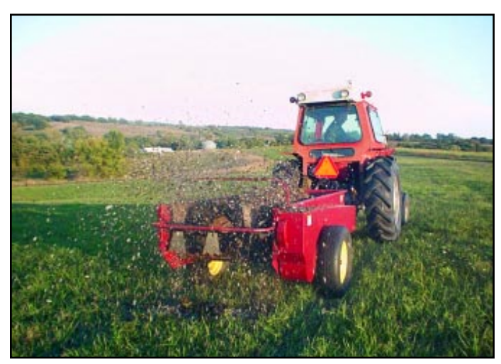
Alpaca manure has value. In some areas, it can be sold or traded to neighboring farmers needing fertilizer for crops, pastures, or gardens. You can use it on your own crop or hay fields and reduce fertilizer expenses.

Having two complete sets of scoops, rakes, and buckets to do the cleanup makes the job go much faster and allows both ranchers more fun time with the alpacas after the work is done. Alpaca manure has value. In some areas, it can be sold or traded to neighboring farmers needing fertilizer for crops, pastures, or gardens. You can use it on your own crop or hay fields and reduce fertilizer expenses. However, your alpaca manure should be tested to determine its composition so that proper rates can be determined for applying to fields. Testing labs are