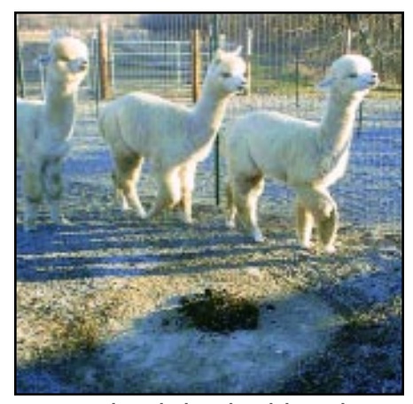
Be sure to 'dose' the barn-limed dung pile to encourage alpacas to use the same spot.