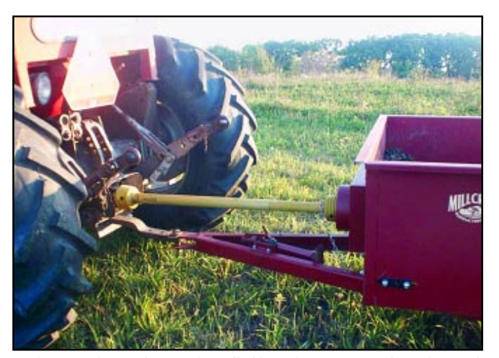
Medium-sized spreaders can be pulled by utility tractors and are designed to be ground driven or powered by a power take-off (PTO) shaft. The PTO shaft is used to transfer the power from the tractor engine to the spreader to drive the manure spreader system.