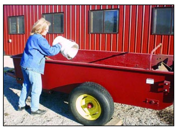
One feature to consider in shopping for a manure spreader is the height of the sides of the spreader. If you lift buckets of manure up and into the spreader, a lower side height is very important.