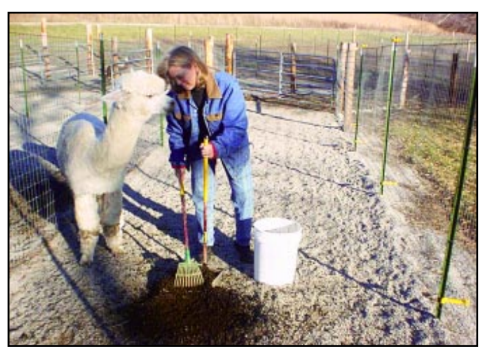
Grabbing a rake, bean scoop, and five-gallon bucket to clean up after your alpacas is just part of the business. Manure management may not be the most fun part of alpaca ranching, but with the right tools and products it can become an efficient process that helps keep your alpacas healthy.

alpaca pens. When the weather warms up, it can then be loaded in the spreader and applied to a field.