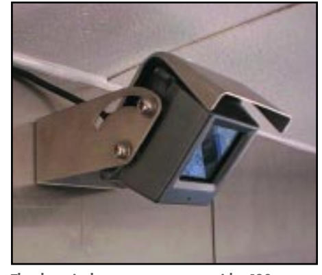
The three inch camera covers a wide, 130degree angle, has a stainless steel mounting bracket, is water-resistant, and handles road vibration very well.

After that, it was really a toss up as to when they decided to lie down and when to stand. When we pulled off the road for fuel or food, they almost always stood up as soon as we stopped, looking around at the new sights.