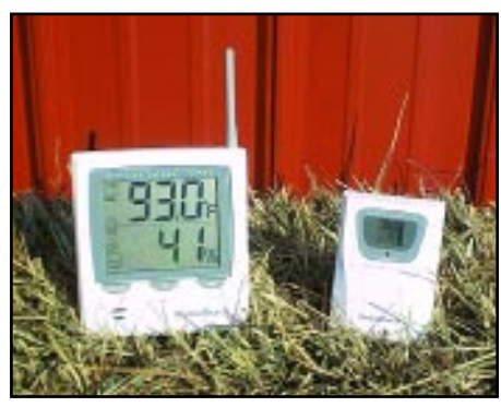
Wireless temperature and humidity monitoring equipment is simple to install and invaluable for transporting in hot weather. The temperature and humidity sensor is easily mounted in the trailer (no wires to run), and is very accurate.

On one transport, we had a pregnant female (with a drastic hormonal change) who decided she would bite at every alpaca she could reach in the trailer. We noted this on the monitor, pulled over to the side of the road, and resolved the situation. No more biting problems the rest of the trip, even on the way back home. Without the camera, we would not have known there was a problem.