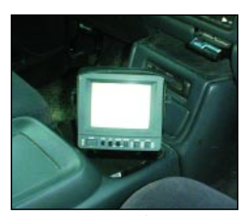
An RV security camera used for assisting RV owners in backing makes a great alpaca trailer security camera system.

The first time we used our camera and monitor, we learned that alpacas don't always cush or lie down after the first few minutes on the road. Ours actually stood up for hours before lying down.