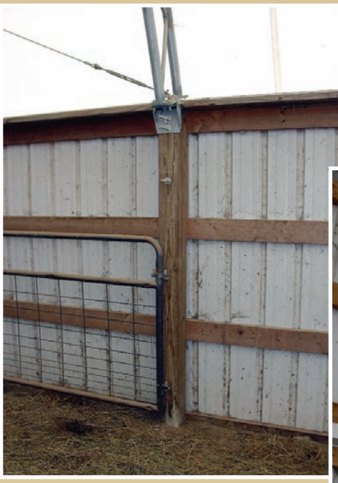
Above: The arched trusses of the Post building are bolted to the top of 6' x 6' treated wooden posts, which are set in concrete about four feet in the ground.

Below: Fabric on hoop buildings is stretched very tight the entire length of the building and is kept under tension by utilizing pipes, web strap lacing, and heavy-duty ratchets.