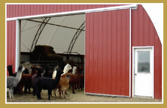
Alpacas of Buffalo Creek (Jim and Karen Post) included both sliding doors and walkthrough doors in a solid end wall to provide maximum flexibility. The photo was taken on a cloudy day, but note the inside of the building is very light and bright.