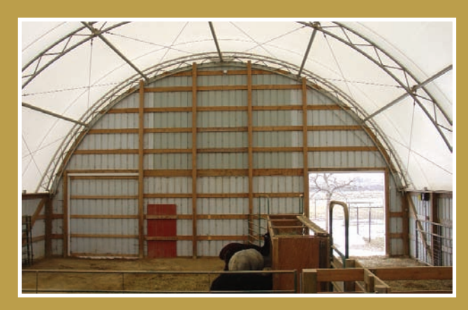
The end-wall of this hoop building has been totally framed up and skinned with metal. The framing allows for easy installation of various door configurations. Note the heavy duty tubular trusses, cable cross bracing and tubular purlins (pipes running between the trusses).

The cost to build their hoop building was significantly less than that of a traditional metal-skinned building. Their building is usually about 10° cooler than outside air in the summer and seems to be about 10° warmer in the winter. Their floor material is packed lime and Jim feels it is superior to concrete. The lime is more forgiving on the alpaca's legs and tends to absorb moisture and drain off much better than the concrete. The Starks' building has single hoop frames spaced 10' apart. Their building is a Cover-All and is thirty feet by sixty feet. It is oriented