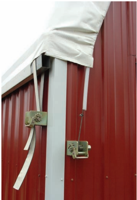
Above: The fabric is stretched tight over the top and down the sides of the buildings and also kept under tension by a system of cables, straps and heavy-duty ratchets. The cover is a rip-stop, twelve and a half ounce, twenty-four mil, polyethylene, fabric.

Their building is 36' x 70' and is twentyfive feet high. It has walk-through openings for alpacas out the south sidewall of the building and a 12' x 16' sliding door in the east end-wall. Inside the west end of the building is a woodframed, fifteen-foot long room the width of the building. The ceiling stringers on this room are heavy duty and the Bacons store their hay on top. They installed louvered vents near the top of both end walls. The metal arched trusses for this building are one and three-quarter inch tubing spaced five feet apart. Bacons assembled the building themselves using a cherry picker boom truck. The side walls are seven feet high. Arches are 18 feet so ceiling height is 25 feet. Automatic waterers and electrical outlets for fans are located along one side wall.