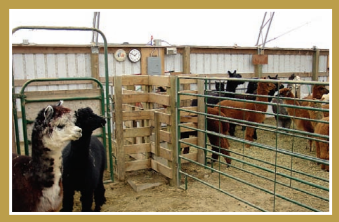
Hoop buildings offer great flexibility because they have a totally clear floor area, free from building columns. An automatic waterer, strategically located in the center of the building, is accessible by animals in up to four pens. A clay floor allows the Post family to reconfigure the pen layout throughout the year.