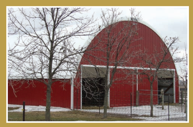
North end wall of the Posts' building has two sliding doors that open up in the summer to allow for outstanding air flow.